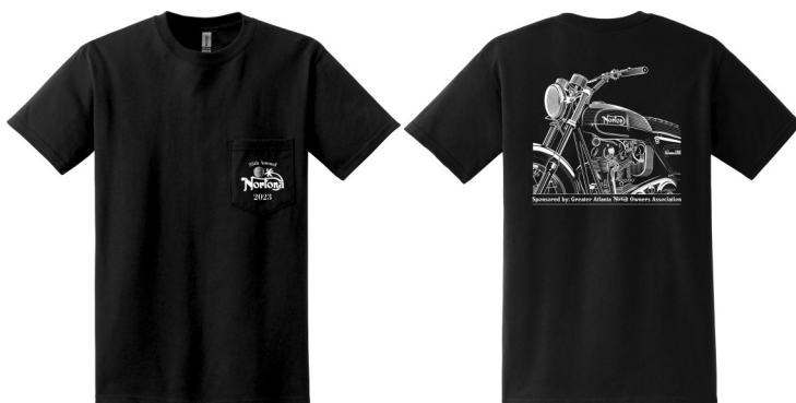
2023 Nortona T-Shirt Design (available on March 9)