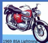
1969 BSA Lightning