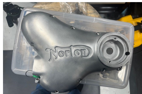
AMR Mods to timing cover