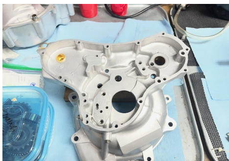
Additional Holes into the timing case