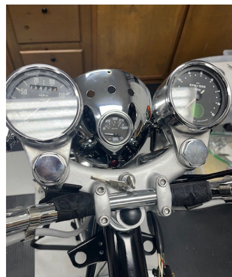
Oil Pressure Gauge Mounting