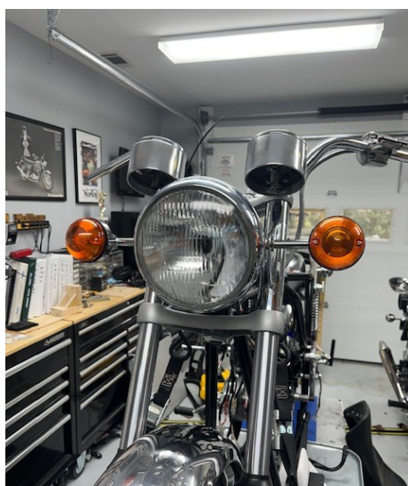
Wiring Harness mostly complete