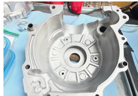
Crank Case Oil Return Mods