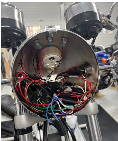
Charge warning, LED Diodes, Flasher Auto stop, and every thing I could think of