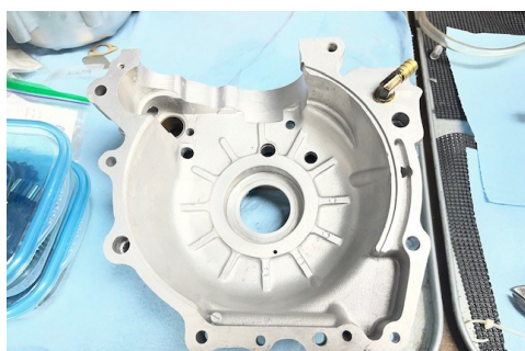
Crank case breather Mods