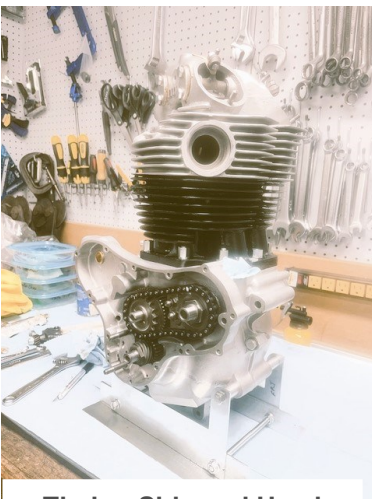
Timing Side and Head