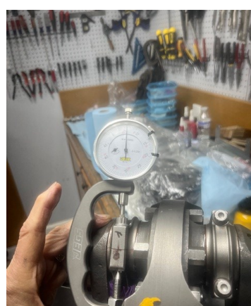
Rod Bolt Stretch