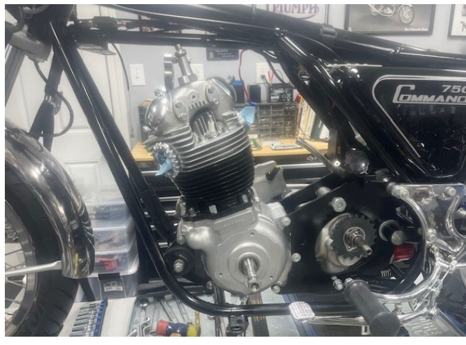
Engine in the Frame