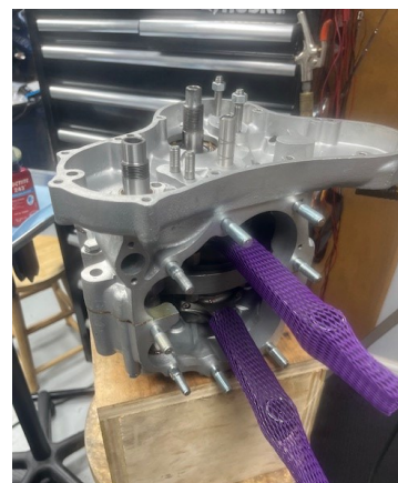
Bottom end installed